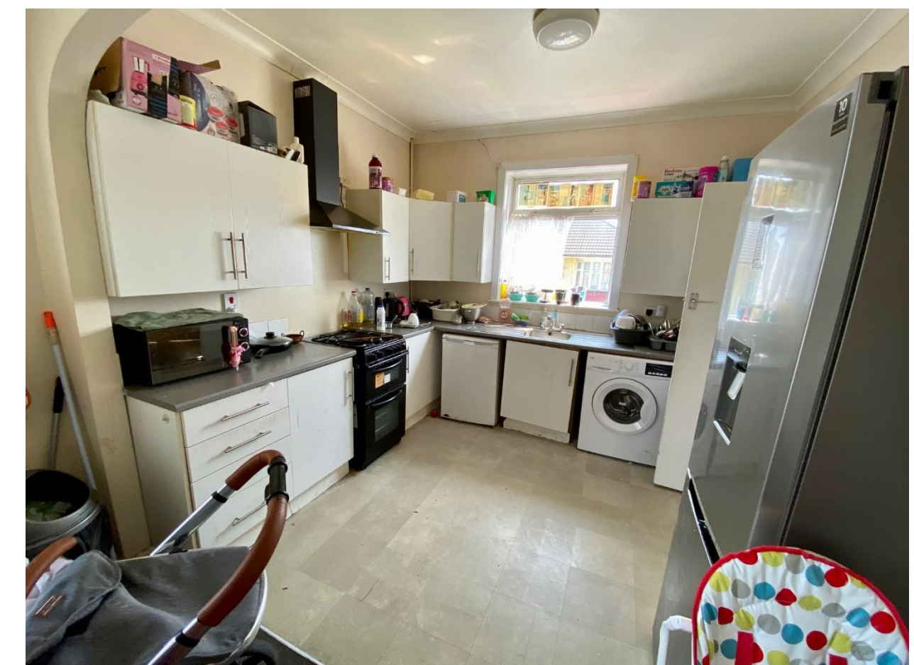
*Maisonette Internal Photos