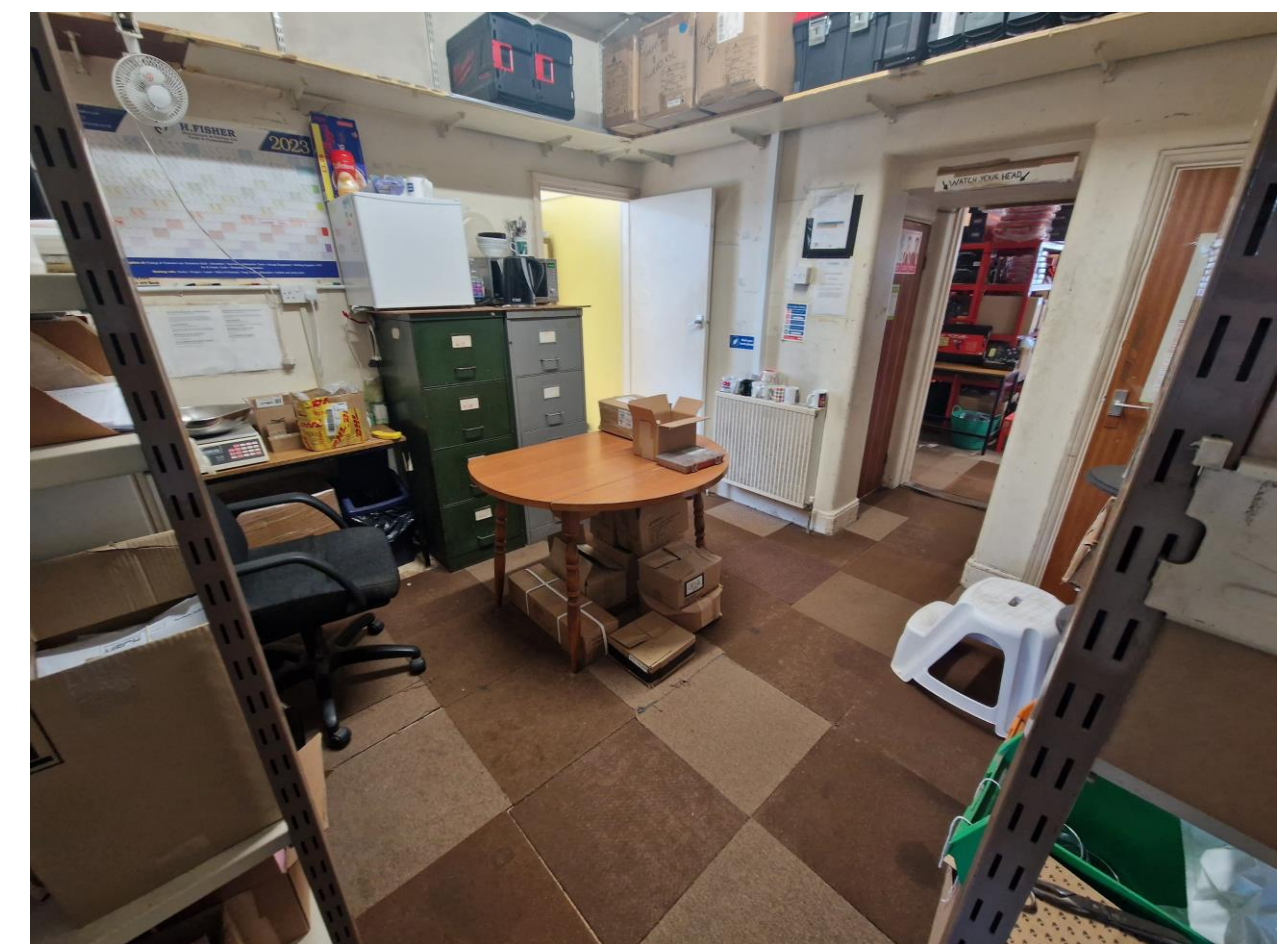
*Ground Floor Internal Photos